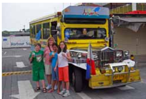
Manila City Jeepney Tour