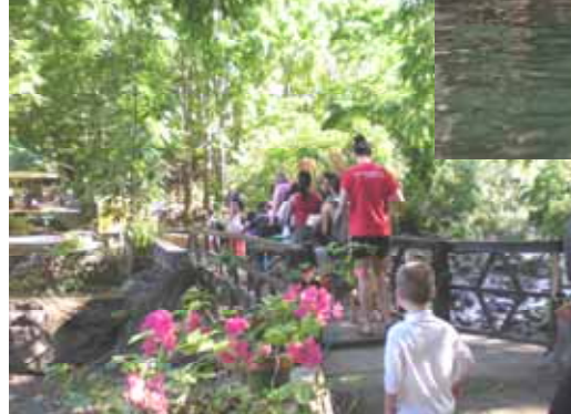
A day of splashing around in a tropical setting of pools and waterfalls