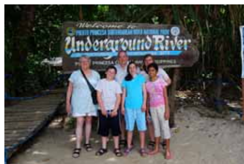
Underground River Tour on Palawan