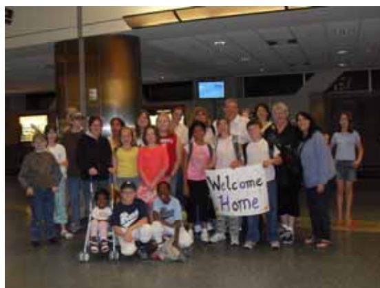
A Welcome Home reception at the Boise airport by other Summer of Hope families.