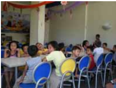
Enjoying an outing with the Rehoboth children to Jollibees, the Philippine equivalent of McDonalds