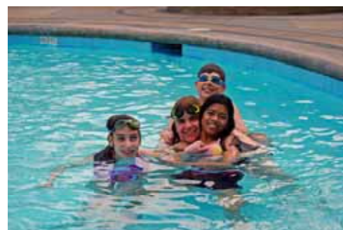
Swimming at the Intercontinental Hotel in Manila