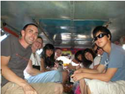
Experiencing a jeepney ride!