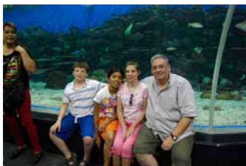
Ocean Park in Manila